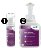
Personal and Pump Bottle Suitable for individual use and at the point of care.