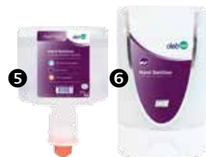
Touch-Free Dispenser, Cartridge & Stand Lockable, reliable, long-life battery touch-free dispenser and hygienically-sealed 1 liter cartridge; suitable for wall-mounting or use on stands.