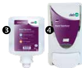
Manual Dispenser & Cartridge Lockable, reliable, low maintenance wall-mounted manual dispenser and hygienically-sealed 1 liter cartridge.